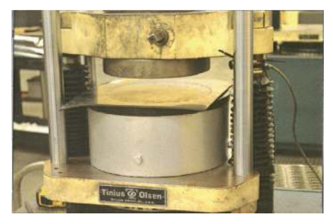
Load Testing Setup

The American Association of State Highway Transportation Officials (AASHTO) established performance criteria for the manufacturing of gray iron castings subject to heavy traffic commonly known as H-20 or HS-20 loading. H-20 refers to a two-axle truck and HS-20 refers to a truck with more than 2 axles. The design criteria for both H-20 and HS-20 consists of truck axle loading of 32,000 lbs, or 16,000 lbs per wheel load.