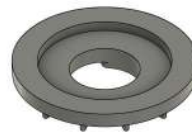
PLDIM Insert for Mueller