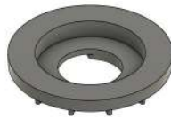
PLDIB Insert for Badger/Orion