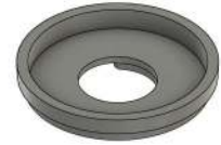
PLDIS Insert for Sensus