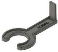
C-Clip for Solid Lid